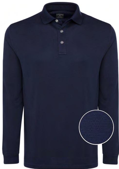
410 Peacoat Navy