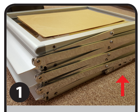
Take product out of the bag and sit with adjustable slide on the bottom.