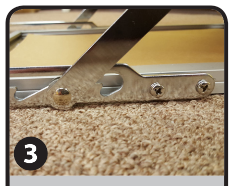
Secure rack using the adjustable height slider. Three height options available.

Designed to support A4 printed materials on the five trays as well as allow users to adjust the height to 3 appropriate positions for advertising versatility.